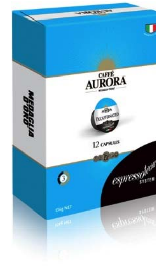
Caffé Aurora Decaffeinated C12

Caffé Aurora Prima Qualita is a medium to dark roast that has been expertly blended and roasted to produce a full-bodied cup with a smooth flavour.