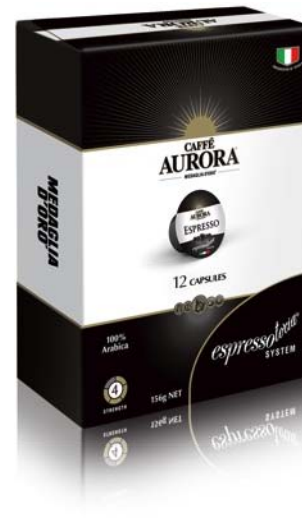
Caffé Aurora 100% Arabica Espresso C12

Boasting a strong well-rounded flavour, Caffé Aurora Italian is a dark roast that has been expertly roasted with the traditional espresso drinker in mind.