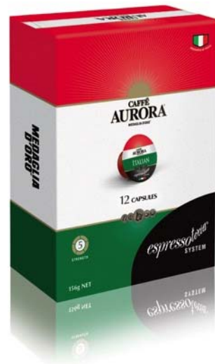
Caffé Aurora Italian C12