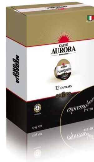
Caffé Aurora Prima Qualita C12

Using only the finest Arabica coffee beans, Caffé Aurora 100% Arabica Espresso is a medium to dark roast offering a well-balanced, medium-bodied cup perfect as an espresso or with milk.